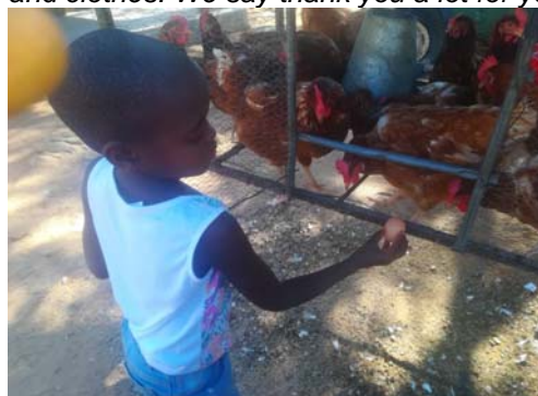
Eggs collected for sale in market in order to raise money to pay for school fees